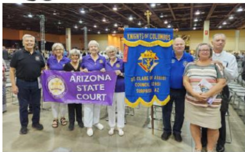
Arizona Rosary Celebration 2024